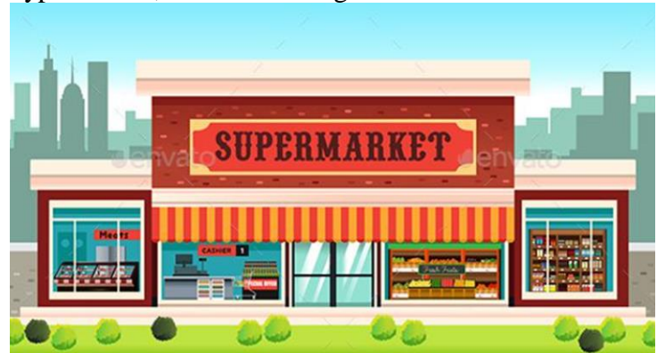
Figure 1 Supermarket

basis. So, supermarkets are known as self-service stores because customers are expected to do all of their shopping without the assistance of salespeople or sales assistants. English Business Dictionary defines supermarket as “A large store, usually selling food and household goods, where customers serve themselves and pay at a checkout”. Supermarkets are self-service format contributing a full line of groceries and other produce occupying between 20,000 to 40,000 square feet of total selling area [6, 7]. The standard store size of a supermarket in the zone of one third that of a hypermarket, but their product span is around 80 percent of the grocery Stock Keeping Units carried by a hypermarket, as shown in Figure 1.