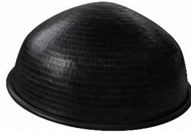
Figure 1 Hemispherical Aluminum Absorber Dome with Solar-Selective Black Coating