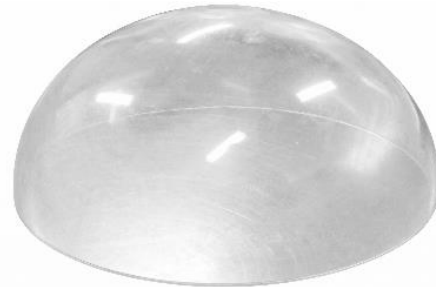
Figure 2 Hemispherical Acrylic Glazing Dome for Wide-Angle Solar Interception