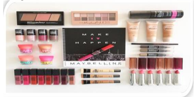
Figure 5 Maybelline's Product Strategy

needs to approach its product from a variety of perspectives to have the best advantage over its rivals in the cosmetics industry. Today Maybelline has taken on a symbolism of its own strategy shown in Figure 5.