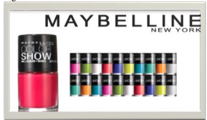
Figure 11 Nail Care Products

Ladies generally are much enamored with nail care items a nail is a horn like envelope covering the tip of the finger and toe in people nail clean is chiefly applied in finger nail and toe nails to enliven and to safeguard the nail plate nail care items will go about as a specialist to forestall nail issues the different nail care items considered for the review are nail clean, nail remover and nail fashioner are shown in Figure 11.