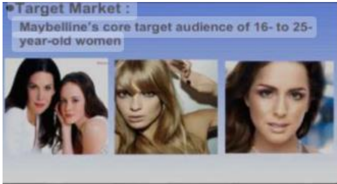
Figure 3 Target Marketing of Maybelline