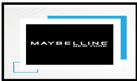
Figure 1 Maybelline Logo