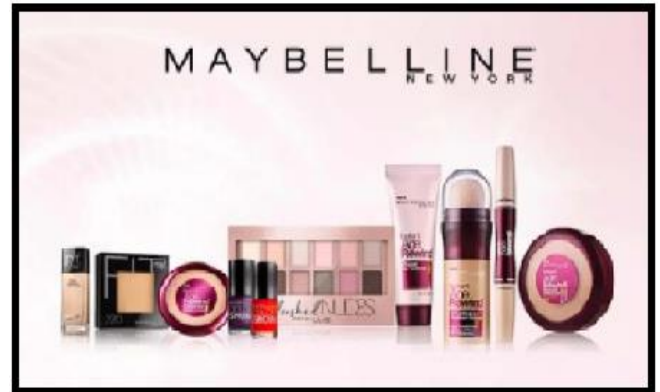
Figure 2 Maybelline Products

The term Maybelline is known to numerous magnificence popular from around the world. As a notable brand that is effectively accessible to customers around the country. Maybelline is a fore runner in the magnificence corrective industry making probably the highest quality cosmetics available anywhere. Today Maybelline is a leading global brand in the cosmetics industry with an extensive product range. Maybelline has produced quality cosmetics products for women of all ages around the globe. Offering superior products, quality and unique colors that is suitable for all Indian skin tones. Now let us understand Maybelline further by going through its target market. Maybelline logo and products, as in Figure 1 & 2.