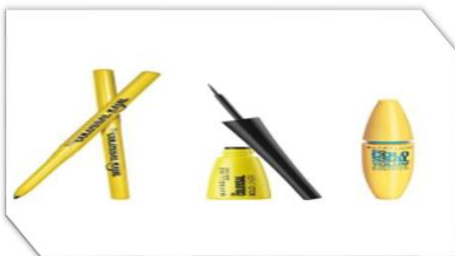
Figure 10 Eye Care Cosmetics

Eye care items are predominantly utilized for keeping the eyes delightful and gleaming individual generally needed to make their eyes and lashes more gorgeous eyes are the piece of our face which is more defenseless to surface level changes It is said that a slight change in variety or little changes made on the eyes can emphatically upgrade our appearance and assists with helping our self-assurance the different eye care items considered for the review are eye lashes, eye liner, key forehead pencil and mascara are shown in Figure 10.