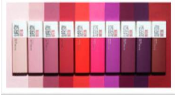
Figure 9 Lip Cosmetic Products

Lip care items are corrective definition utilized for beautification of lips it gives help full method for refreshing securing or shading of lips it additionally safeguards the lips from the impact of cool dry climate bright beams and wind the different lip care items considered for the review are lip stick, lip liner, lip pencil, lip gleams, lip stick are shown in Figure 9.