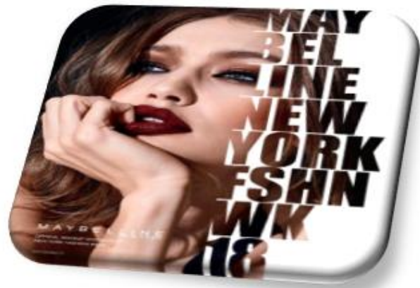
Figure 8 Maybelline Brand Ambassador