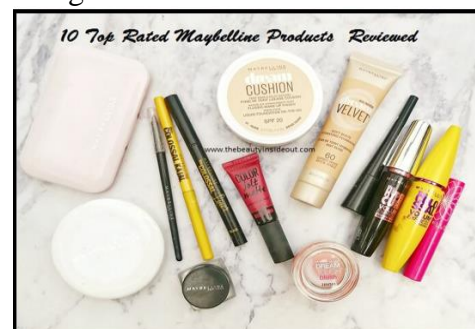
Figure 12 Skin Care Management Products of Maybelline

Skin is the most astounding and the biggest organ of the body it safeguards the body from microscopic organisms' infection and natural harms so it is fairly the obligation of each and every one to safeguard this biggest organ in the body the utilization of healthy skin items relies upon the sort of skin which can be normal dry or sleek the factors considered with the end goal of study incorporate face wash establishment cleaning agent and lotions etc. all are shown in Figure 12.