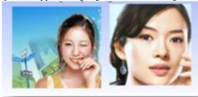
Figure 4 Marketing mix of Maybelline

Showcasing mix of Maybelline showcasing blend is a model that alludes. To the exercise includes while showcasing an organization item to advanced deals and acquiring clients. The goal of characterizing the market blend is to guarantee. That an organization endeavors are centered on the right blend of exercises that will allow it to successfully meet. Its expected benefit target allows us to take a gander at how Maybelline has its showcasing blend system set up in the approaching segments shown in Figure 4.