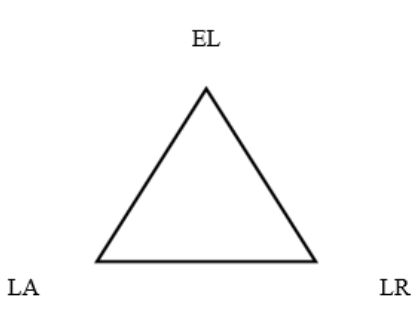
Figure 2 The Learning Triangle

(EL: English Language; LA: Language aspirants; LR: Learning Resources)